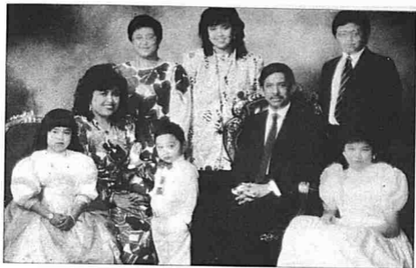
HRH, Sultan of Brunei with his two wives and families.